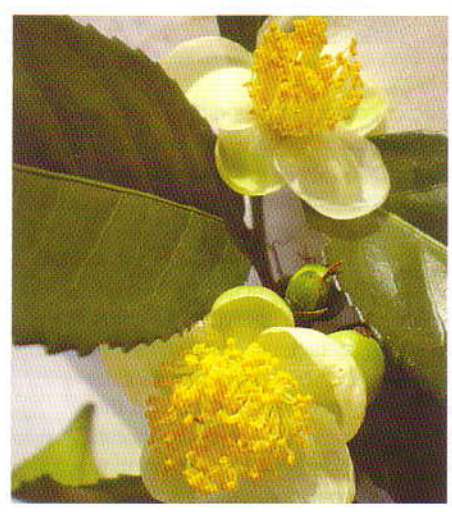
Green tea plant (Camellia sinensis).

To sum up, flavonoids are compounds that display significant effects on all human organisms, including the skin.8