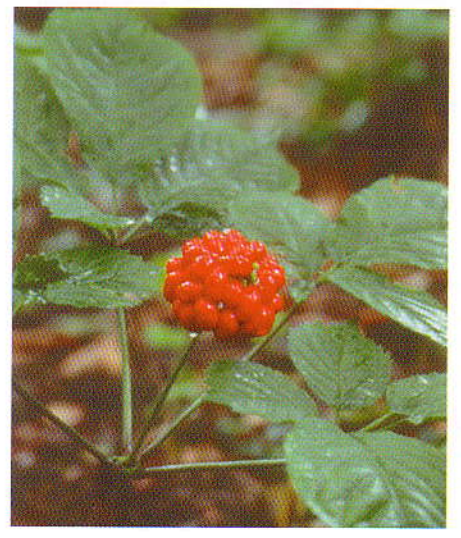
Ginseng (Panax ginseng).

Matricaria chamomilla is named also as wild chamomile or German chamomile. Flavonoids of this plant are very similar to the compounds abundant in Roman chamomile – apigenin appears to be a compound of the highest level. There